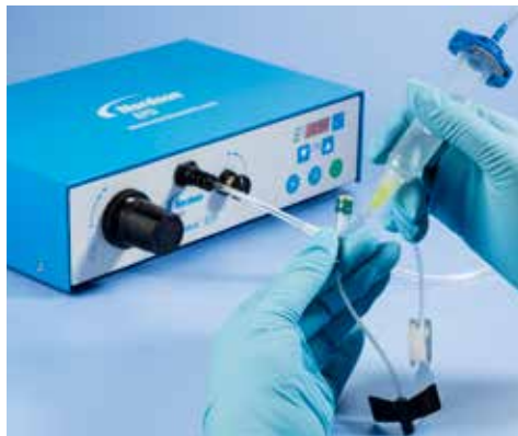
Dispensing a low-viscosity solvent on medical devices.

Nordson EFD's Performus™ X dispensers increase throughput, improve yields, and reduce production costs through controlled application of adhesives, lubricants, and other assembly fluids.