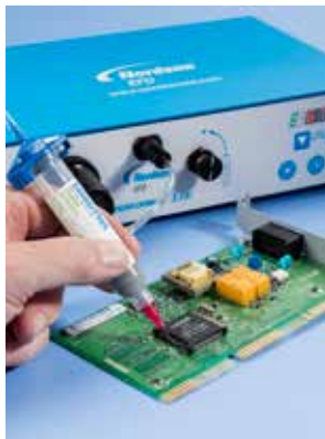
Dispensing SolderPlus® solder paste on PCB boards.