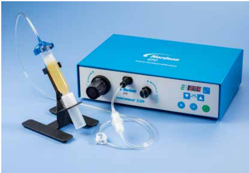
Performus X dispensers provide reliable dispensing for general applications in a wide range of industries.

Reliable benchtop fluid dispensing control for general applications