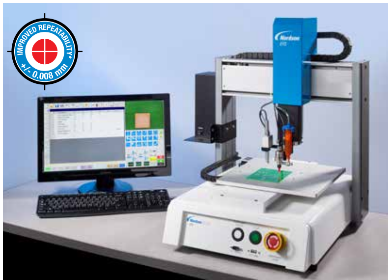
EV Series pencil camera vision makes programming patterns easier.

Easy automation for precise fluid application with simple vision pencil camera