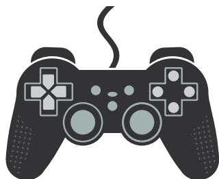
Optional joystick puts the control of axis movement in your hands.