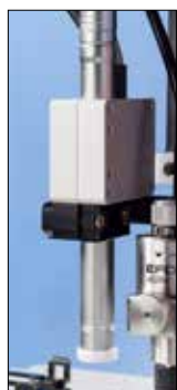
Pencil camera verifies product presence

* X/Y calibration delivers best-in-class repeatability